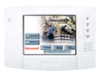
8132 Symphony Advanced User Interface

A blend of head-turning style and sophisticated technology, Honeywell's touchscreen keypads make it easier than ever to take advantage of your security system features and options, with graphics and menu-driven prompts guiding you and your employees every step of the way. Available in black and white (6270 TouchCenter) and color (8132 Symphony Advanced User Interface).